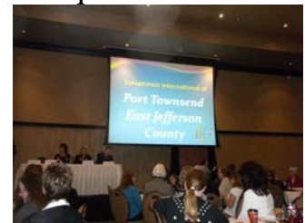
Our club being recognized at the event